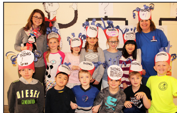
Second graders show off their hats on Dr. Seuss Day.