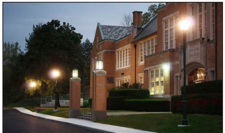
(Right) Lights would be converted to LED technology and older sidewalks would be restored.